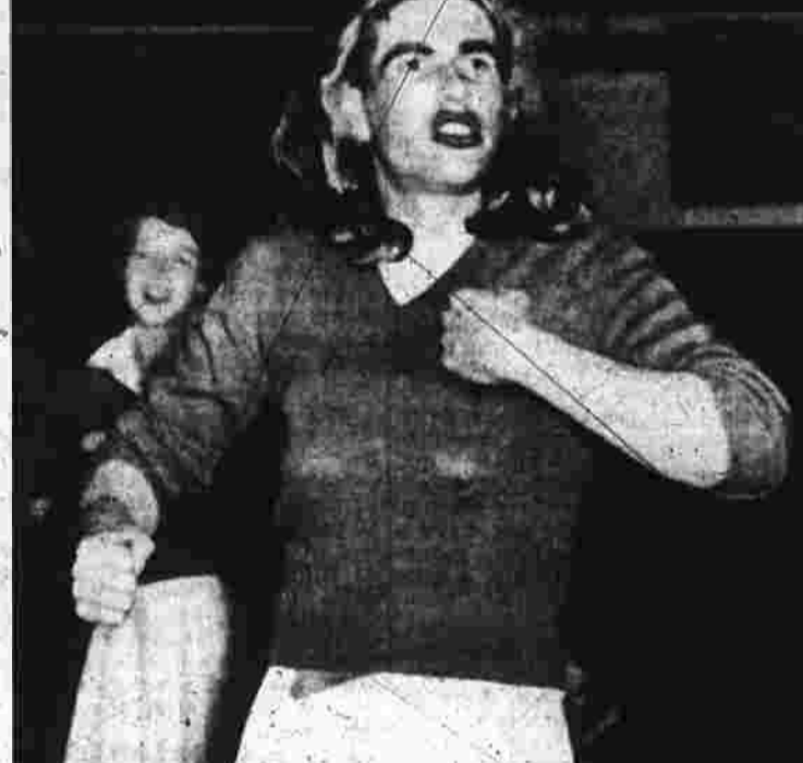
Two unidentified (in obvious rascals) students at Manchester High are shown above during a timeout period in the basketball game between the Faculty and Seniors, won by the latter.